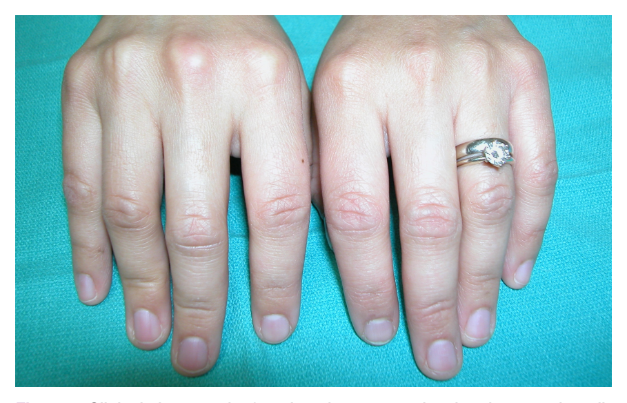
Figure 4. Clinical photograph after closed treatment showing decreased swelling and improved tendon alignment similar to contralateral hand (Case 1).

extension, and the interphalangeal (IP) joints free. In this position, the extensor tendon was centralized and remained reduced with active IP joint motion (Figure 2). This splint was worn at all time except for bathing, including sleep. At follow-up clinical exams, the tendon remained located centrally while splint was in place. Erythema, swelling, and pain decreased over the next few weeks with the treatment regimen.