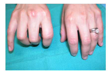
Figure 1. Clinical photograph of the right metacarpophalangeal joint showing ulnar dislocation of sagittal band of the right hand middle finger (Case 1).

The patient was placed in a volar splint that held the MCP joint in 25° of flexion, the wrist in 25° of