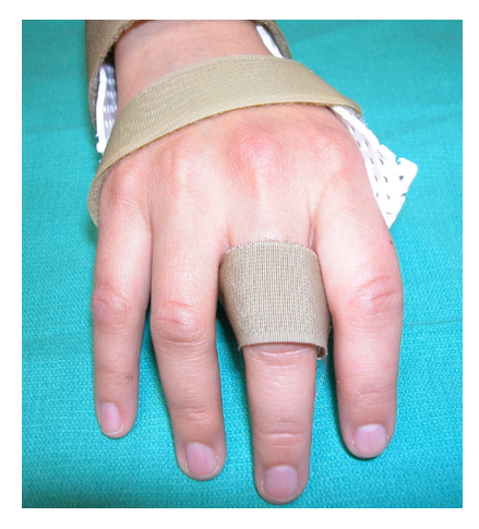
Figure 2. Hand in extension splint demonstrating centralization of extensor tendon (Case 1).

Figure 1. Clinical photograph of the right metacarpophalangeal joint showing ulnar dislocation of sagittal band of the right hand middle finger (Case 1).